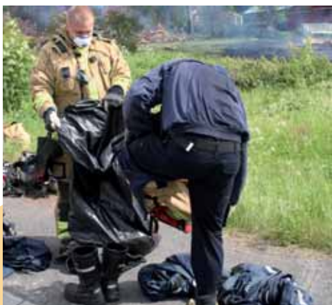
Contaminated clothing is removed after an alarm

The use of this model has led to safer and healthier routines that are supported and used by all personnel. This has contributed to a better work climate. The routines have also contributed to more effective use of personnel and equipment. Due to the participatory approach the personnel have taken a more active and constructive role in identifying potential risks and developing preventive measures. They also have a more positive attitude to work-related health and safety issues.