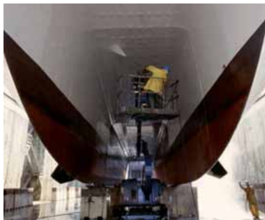
The dry dock at Concarneau, Brittany

No accident has been recorded on this site for more than three years. From some perspectives, improvements in safety issues might be seen as unproductive investments. However, the current demands on the ship repair sector in terms of quality and productivity are very high, and many workers are involved in the activities. The job requires skilled and experienced employees who are difficult to replace in case of absence. Therefore, a low absenteeism rate is an absolute must for the smooth running of a repair dock. A management aiming at improving working conditions and preventing occupational diseases and accidents is essential for the achievement of these objectives.