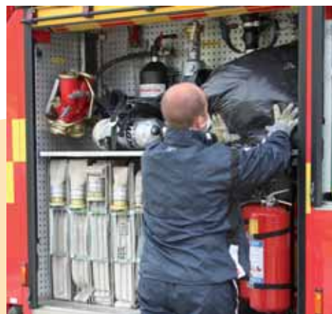
Contaminated clothing is transported separately from personnel in the vehicle