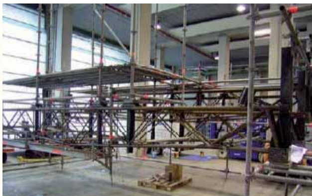
A test model at the workplace

The new scaffolding is a safe solution that tackles the problem at source. It is easy to construct and climb, and it also allows the work to be carried out more efficiently, almost completely eliminating the need for employees to wait for long periods to start or resume their work. This also contributes to a good working atmosphere. A feature of the development of the new scaffolding was the involvement of various parties in the maintenance chain: employees, scaffolding builders, an engineering consultancy and the project team.