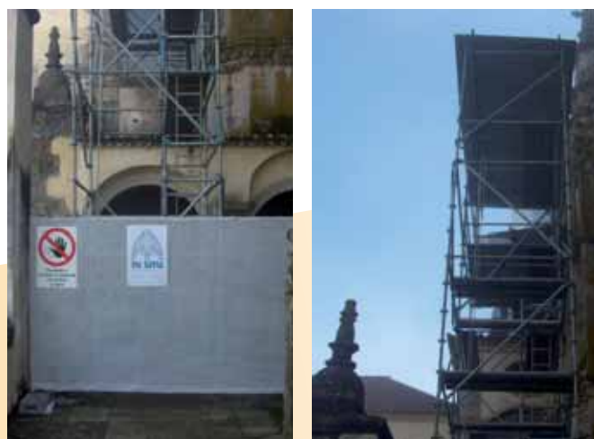
Scaffolding and signposting of risky areas on the ancient historic site