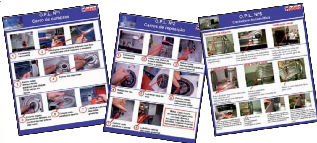
Examples of ‘one point lessons’ (OPLs) on the maintenance of shopping trolleys and slicing machines respectively

The solutions found have brought considerable benefits in terms of reducing accidents at work and increasing all workers’ risk awareness. They have also resulted in a considerable decline in the insurance premiums paid by the group to cover accidents at work. After the maintenance safety project was introduced, accident premiums fell by about 31%, which translates to a saving of €1,002,760 compared to the amount paid in 2006.