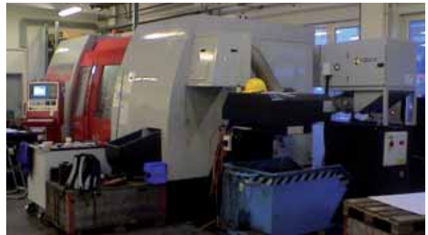
A new wet cartridge filter was installed for cooling lubricant aerosols at ground level