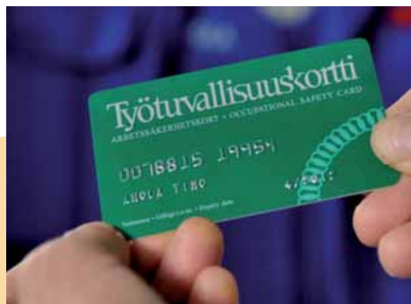
Safety card

With a decrease in accidents, sick leave has also declined. Overlapping occupational safety training has also decreased and there is more time for proper orientation. The improvement in work flow and positive changes in the working atmosphere have had a positive effect on productivity.