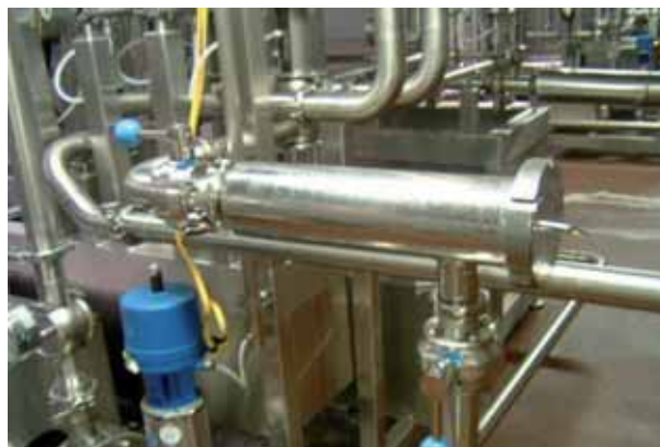
Installed isolation valves

The result of this initiative is that, at the time of writing, the plant had gone 19 months without a lost time accident on this site. The major cost benefit is the avoidance of lost time accidents, which mean bringing in temporary employees to cover those off sick through injury. There is also the avoidance of potential downtime in the plant while incidents/accidents are investigated.