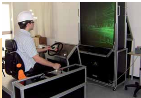
Practical training by using simulators

In the central machinery pool efficiency is higher than expected because the protocol has brought about increases in operability, performance, efficiency and qualification of machinery and personnel. There has been a fall in work-related accidents during maintenance and repair operations, an improvement in machinery operating conditions and an improvement in the performance of the equipment due to decreased stoppage and breakdown times. It also has a significant impact on the health of the employees who work on or near the equipment during their time on the job site, although this impact is difficult to quantify.