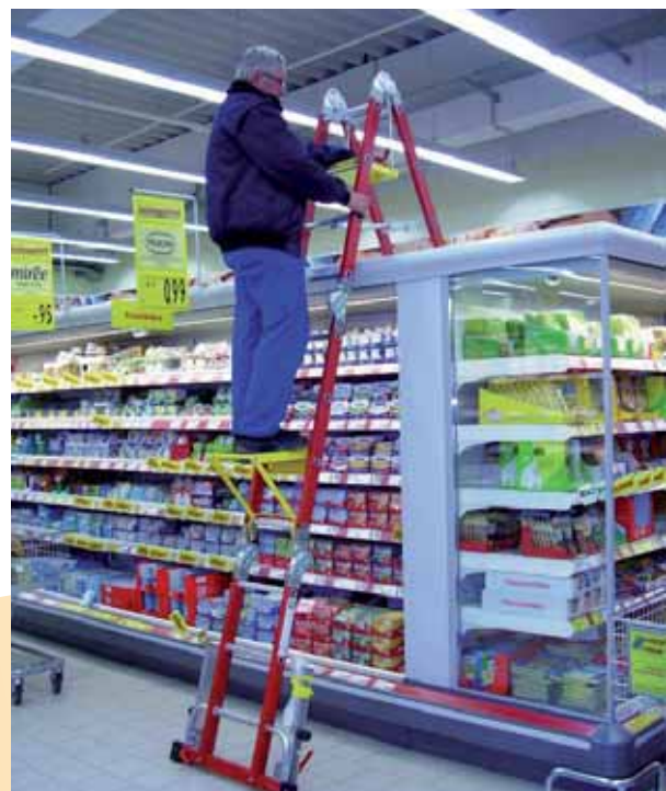
Working on the refrigeration system with asymmetrical fibreglass ladder (with mounted platform and storage tray)

Occupational risks have been dramatically reduced. With the ladder resting directly on the refrigeration system roof, there is no need to risk bridging the gap between a stepladder and the system roof, which entails the risk of falling. The fact that the ladder is fixed in place and equipped with non-slip rubber feet minimises the sliding risk. The insulating fibreglass finish also allows the ladder to be used when working with electric current. Since the ladder was introduced, no accidents in connection with work on refrigeration system roofs have been recorded.