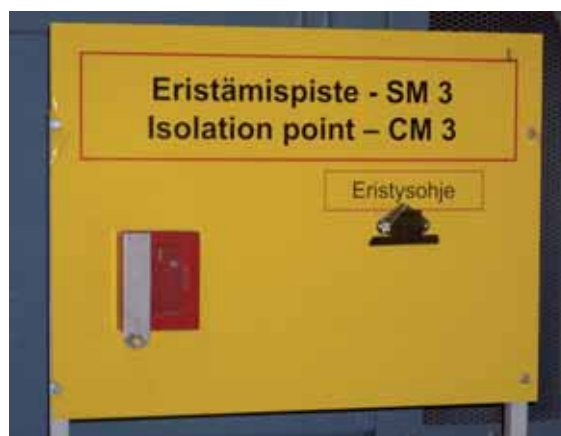
Isolation point: cabinet for key(s) to locks used in isolation and place for the isolation instructions

The safety of maintenance work is monitored along with industrial health and safety in general. Health and safety metrics used are accident frequency and severity. Proactive metrics used are the numbers of safety observations and near-accident reports as well as the implementation of the related corrective measures. The accident figures went down in the factory after the measures were introduced. One of the main success factors of the initiative is the involvement of the whole organisation, including workers and the senior management.