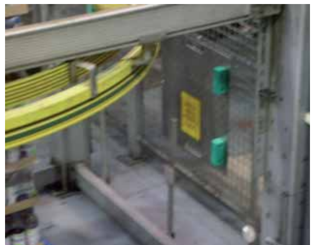
The Palletiser Maintenance Board developed at Britvic Soft Drinks