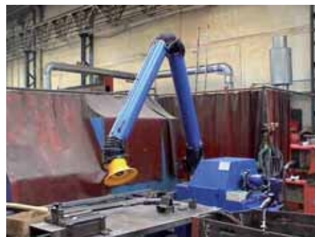
An optimally adjustable extractor effectively removes dust and fumes during welding works