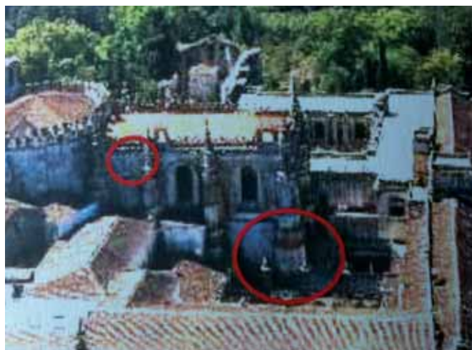
The red circles show the areas on the building where conservation work was carried out

There was a significant reduction in the accident rate, and an increase in the quality of the works. The productivity of the company rose considerably and costs were reduced. All works and services were delivered in time and according to the requirements of the contract.