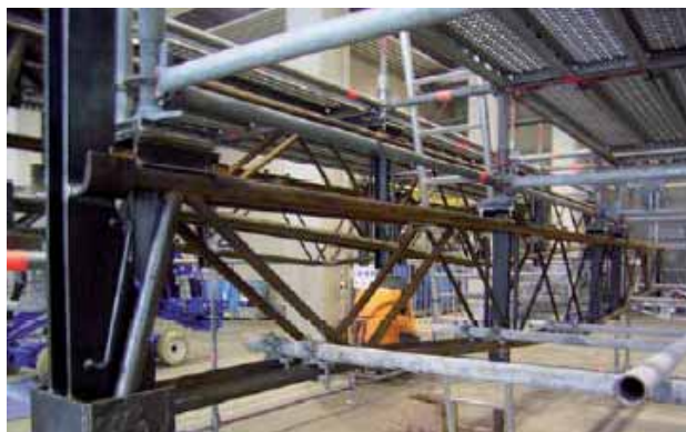
'Saddles' for the special lattice girders