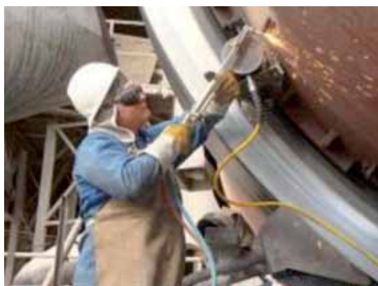
Maintenance work involving welding

The feedback was very positive, and the contractors have suggested specific issues on which they need additional training. These comments are the basis on which Titan, Hellenic Petroleum and Halyvourgiki will continue this useful initiative to form an ongoing action rather than an individual effort. The most important success factor is that the initiative was launched by the top management of the three client companies.