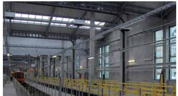
Openings and outlets on the roof and on the side of buildings substantially improve lighting

Each of these accidents has been analysed. This has led to preventive and corrective measures to avoid recurrence.