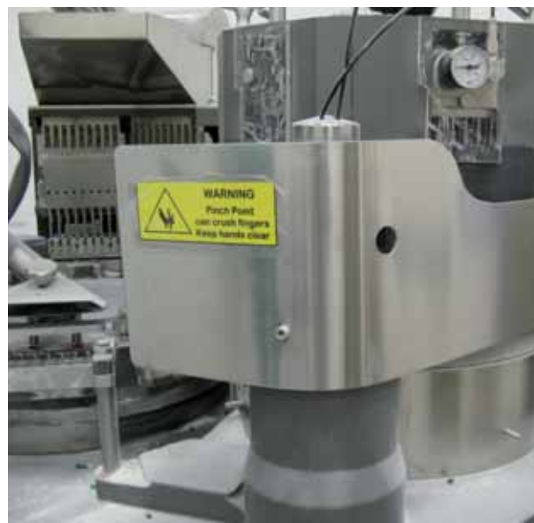
New guards to cover area where there are moving parts

Adjustments made to the equipment minimised the risk of an accident. Following a proactive approach, a risk assessment is carried out for new tasks and new equipment to ensure that maintenance and operation can be done safely. The most important achievement is that employees are now fully aware that maintenance has to be carried out in a safe manner, resulting in a change of the safety culture.