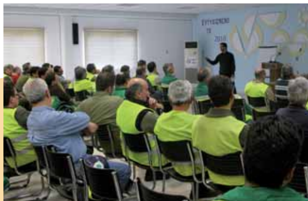
The new system is explained to all parties involved