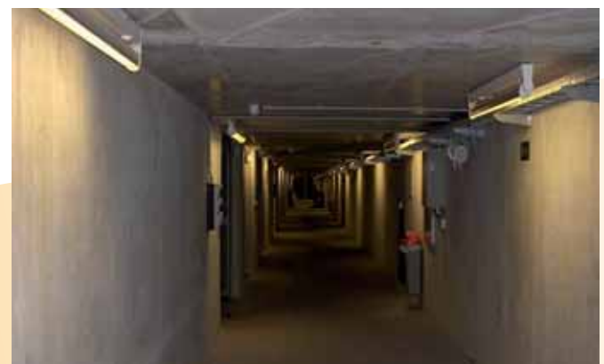
An underground corridor allows staff to move around safely without risk from high voltages