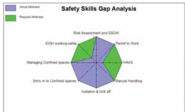
The competency assessment for each worker showed where there were gaps in safety skills