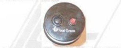
Fig. 4 - Elementele de acționare / declanșare: Meniștură aplicată / necesită și sigla firmei (Total Green), caracteristicile de declanșare instantanee (I 2 ) și curentul nominal (20 A)