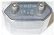
Fig. 1 - Marcaje aplicate pe produs.