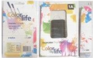
Fig. 2 - Ambalajul produsului