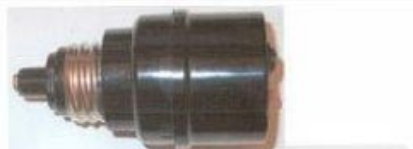
Fig. 3 - Formă constructivă - cu filare pe tip E27