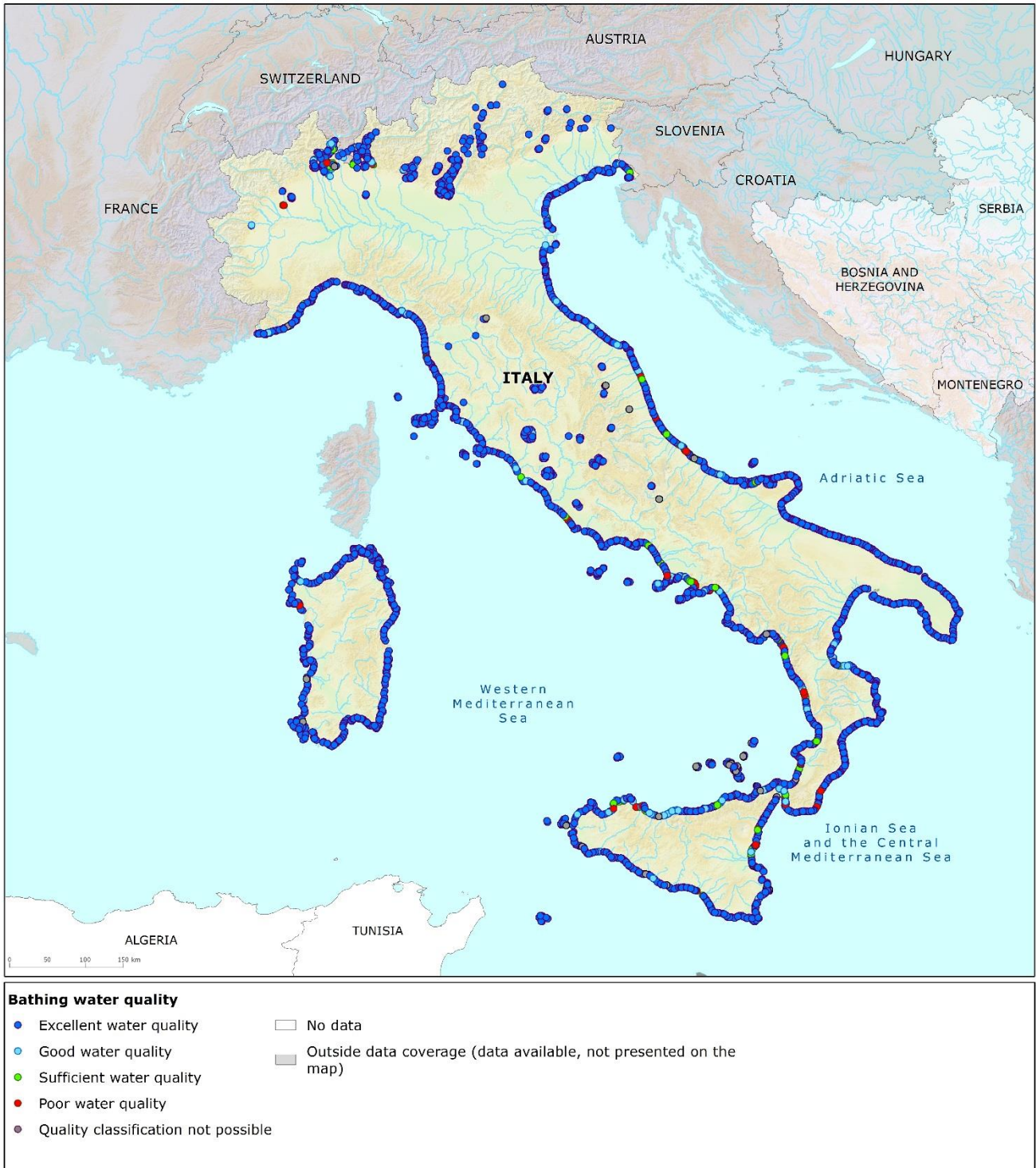
Map 1: Bathing waters reported during the 2019 bathing season in Italy