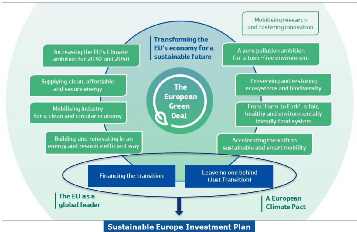
Figure 1. The Investment Plan within the European Green Deal

The Sustainable Europe Investment Plan will enable the transition to a climate-neutral, green economy across the following three dimensions: